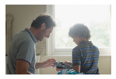
Do not use photography that lacks color or appears washed out.