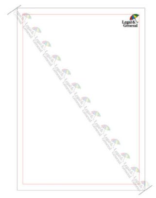
A4, A3 and A2 logo sizes are 1/13th of the diagonal.