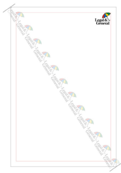
6 and 16 sheet logo sizes are 1/12th of the diagonal.