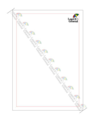
A5 logo size is 1/11th of the diagonal.

The size of our logo is worked out by using the diagonal of the application, dividing it by the length of the logo.