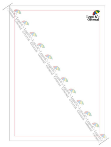
A1 logo size is 1/12th of the diagonal.